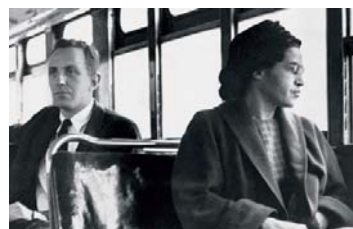
1955 Rosa Parks